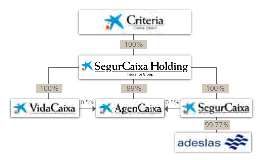
In July 2010, Criteria CaixaCorp directly controls 97.93% of SegurCaixa and SegurCaixa Holding the rest. It is foreseen that this stake will be restructured shortly in accordance with the present company organizational chart.

Lastly, AgenCaixa is the division that has more than 400 sales advisors that carry on their activity in a network of offices where they advise customers and market products and services of the Group especially to self-employed workers, micro enterprises and small and medium enterprises.